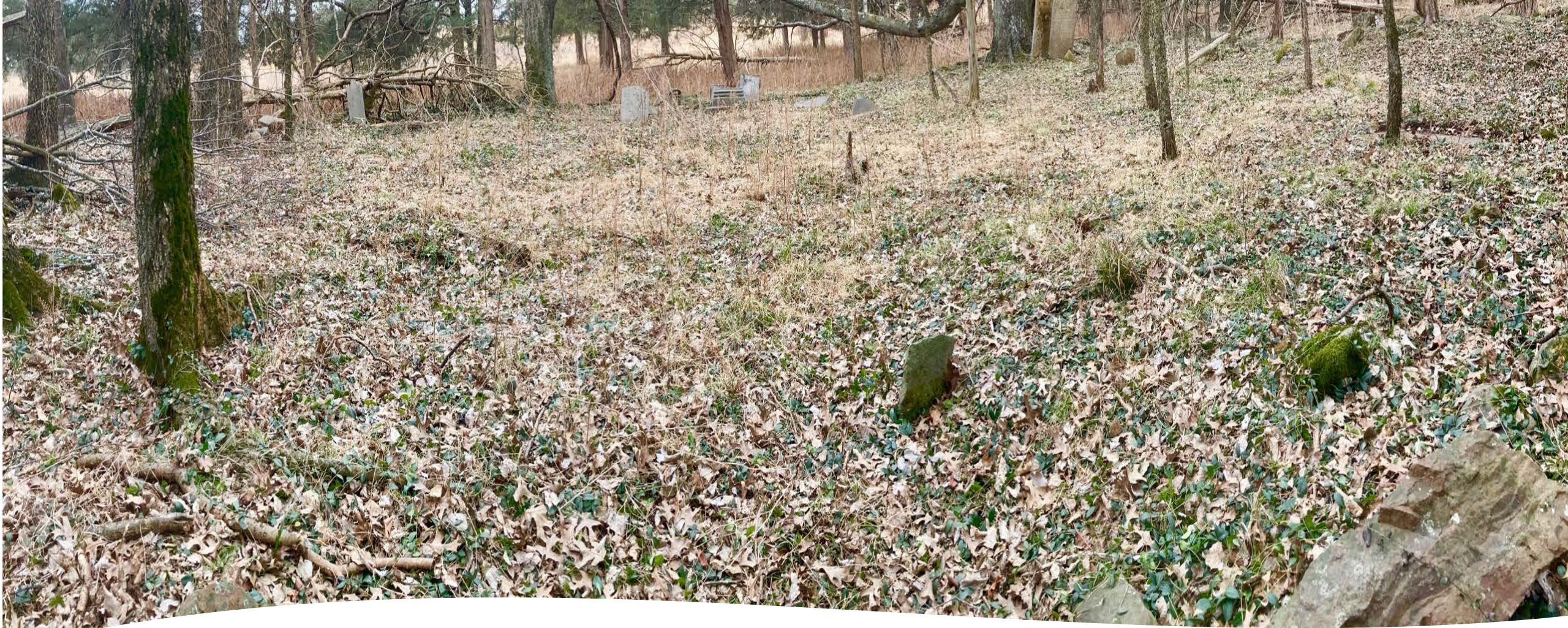
Carter-Taliaferro Cemetery Sudley Farm, Centreville